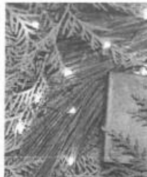
LED Lights $10