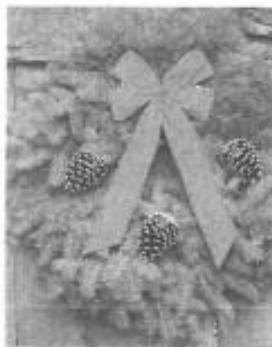
Classic Wreath $35